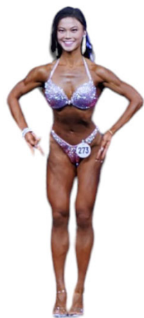
( 面向裁判 ) Start from the Front