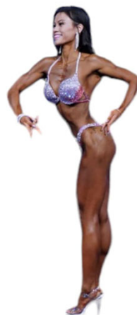
四份一轉體 ( 右轉 ) ( 左面朝著裁判 ) Quarter Turn Right (left side to the judges)