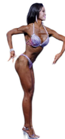
四份一轉體 ( 右轉 ) ( 右面朝著裁判 ) Quarter Turn Right (Right side to the judges)