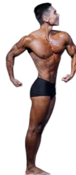
四份一轉體 ( 右轉 ) Quarter Turn Right