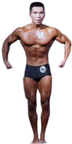
四份一轉體 ( 面向裁判 ) Quarter Turn Front (Face to the judges)