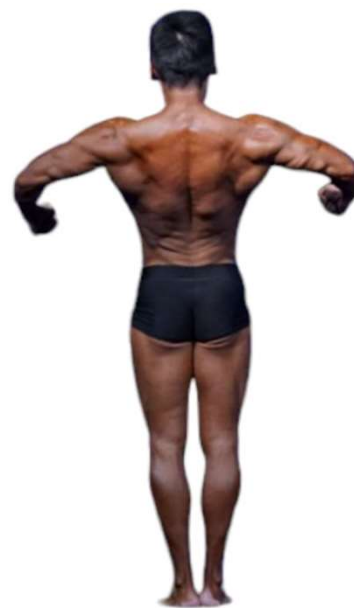
四份一轉體 ( 轉後 ) Quarter Turn Back