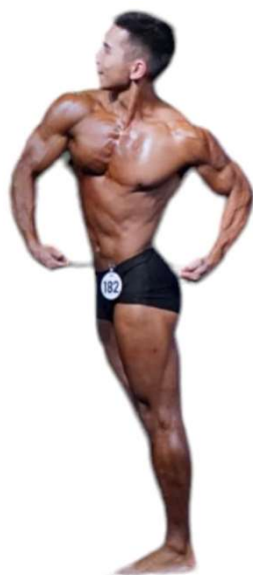
四份一轉體 ( 右轉 ) Quarter Turn Right